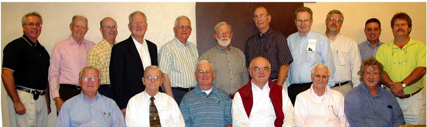
HAV Fall 2007 Seminar Attendees (At least those who were there for the photograph)