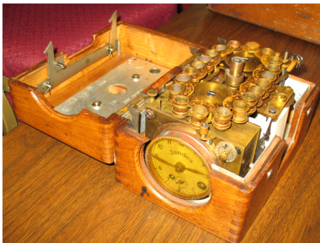
Junghans 1890's racing pigeon timer

Our next Board meeting will be on Sunday, February 22 nd . As always, I encourage all to attend and participate in your Board proceedings. If you can't attend and you have issues you would like to have brought before the Board, please let your Guild Directors know. See you at the convention!!