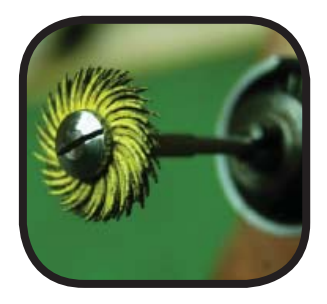
Dave Staib: flexible polishing tools.